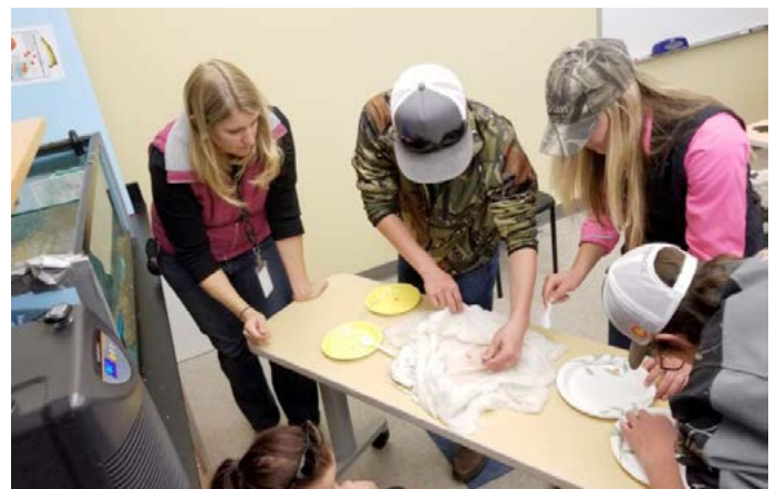
Counting and removing bad eggs before tank insertion