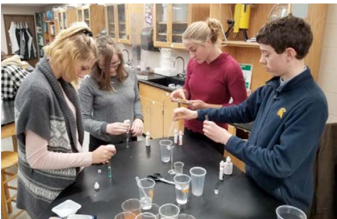
Testing water for acidity, ammonia and nitrites

Mortality of some fish is part of TIC's watersheds' reality lesson. Other key lessons, and observing the fish's behaviors, include information about watershed health. Students learn that trout and the insects they eat are early indicators about water availability and cleanliness, awakening awareness for the fish's survival and also for our human consumption. TIC helps create these awareness lessons which we hope students will remember and carry forward into their adult lives...becoming tomorrow's conservators to help ensure abundant clean, cold water and fish.