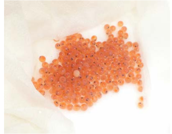
Approximately 180 eyed healthy eggs, including one bad egg

This school year is the first time our RMF Chapter has sponsored three TIC classrooms simultaneously. Two are new schools - Poudre High School and Ridgeview Classical Academy, rejoined by Front Range Community College now that building reconstruction is completed. Our chapter has purchased all of the equipment