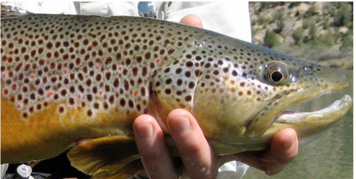
San Juan River Brown