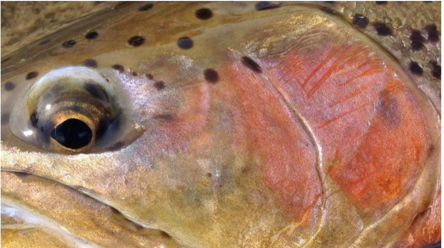
Close-up of Beautiful Rainbow