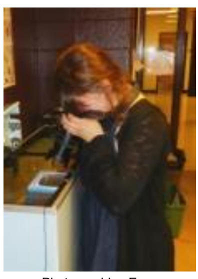
Photographing Eggs