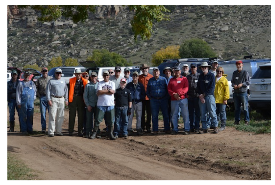
Some of the 32 Volunteers at Sylvan Dale Ranch