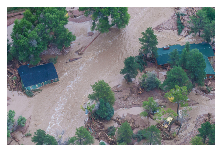
Big Thompson River, Sept. 2013