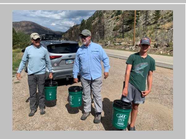
Part of the bucket brigade carrying fish