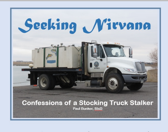
Coming to a TU Chapter near you!

Growing up in New Hampshire, I found fishing was, and still is, a mostly put and take venture. The streambeds and lake bottoms are mostly made of granite, which doesn't make for good bug life. But every once in-a-while, my father would come home from a day on the water with a big smile on face, and if there was a twinkle in his eye, I knew he experienced NH nirvana. Basically, he found a NH DOW stocking trout, followed it, waited for it to stop, watched it empty a fresh batch of a NH trout hatchery's finest, and started catching his 10 fish limit!