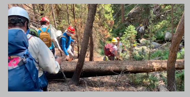
Hiking into the Big South in 2021