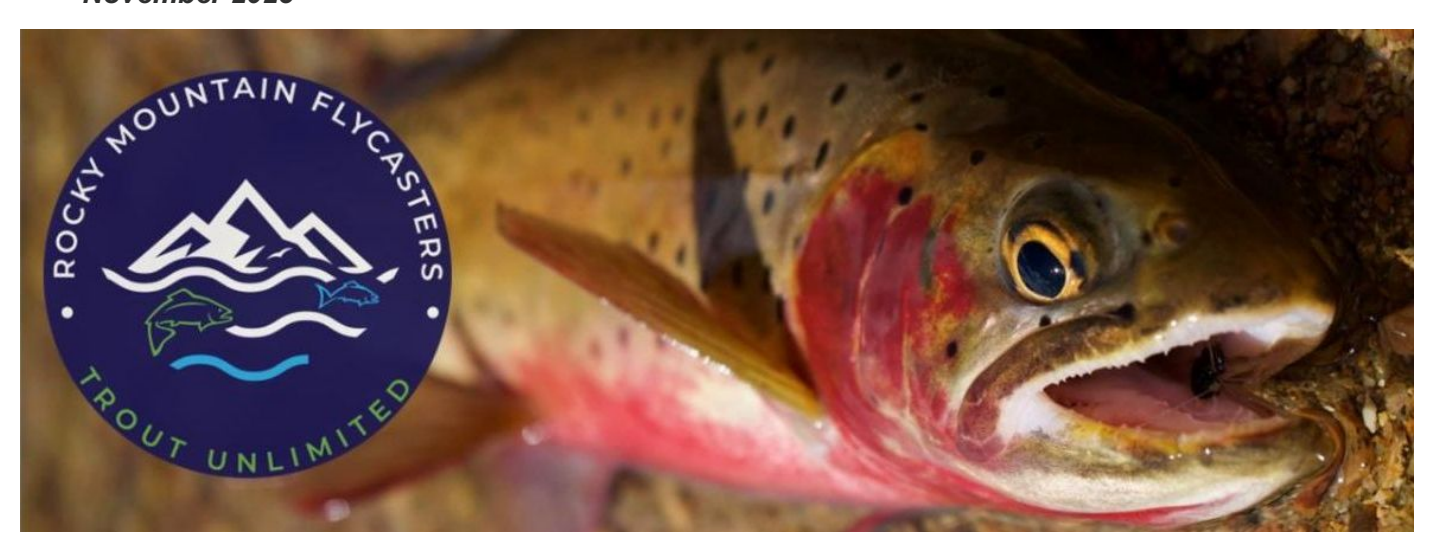
Chapter Gathering November 15 - Northside Aztlan Community Center - 6:00 - 8:30