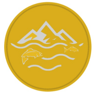
Gold (River Guardian) Donors ($5,000 - $9,999)