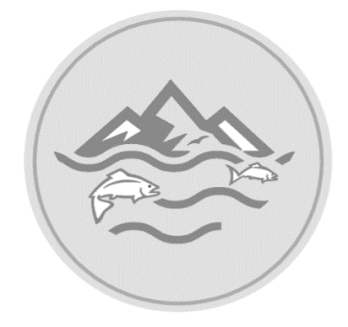
Platinum (River Champion) Donors ($10,000+)