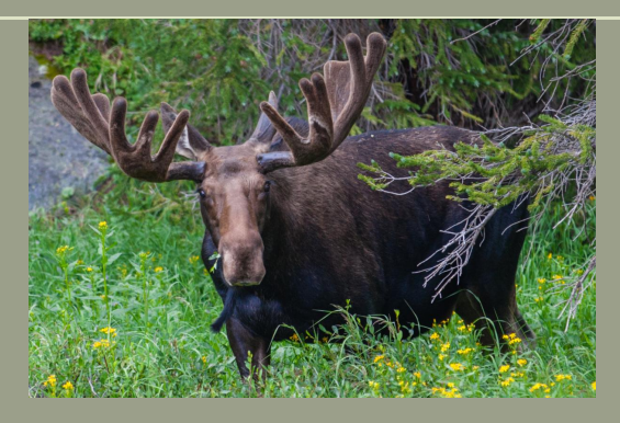
Spring Moose. I have no pictures of the Mountain Lion. We were both in a hurry at the time. (Long Draw Reservoir)