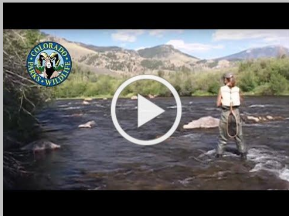
Summer Caddis - Blue River