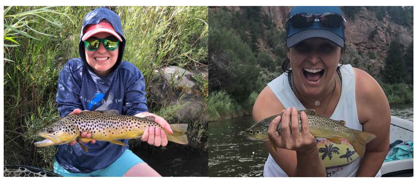
The Flypaper page 5 August, 2019