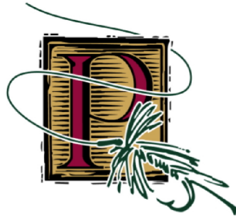
St. Peter's Fly Shop