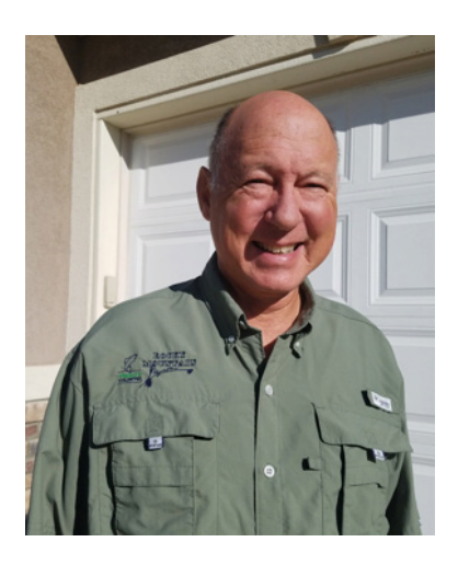
Buy RMF Merchandise