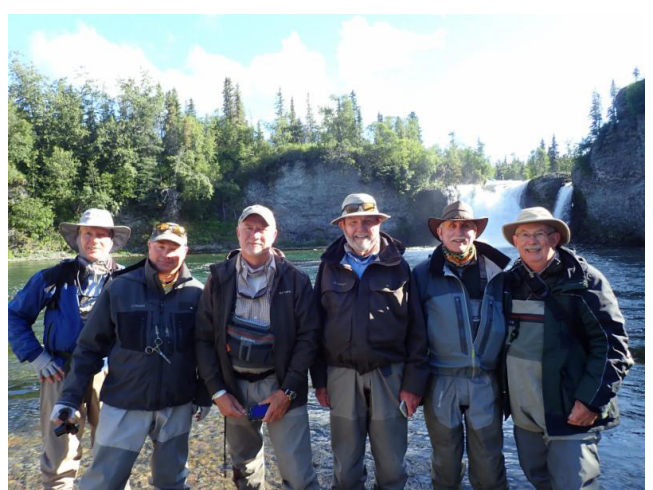
Rocky Mountain Flycasterss in Allaska

Bucket list: places you want to go, experiences you want to have and memories you want to make while you are still standing on this side of the grass. I've acquired things all my life. However, at this stage as I look to the hopeful years before me, I crave adventures not possessions. I have enough stuff.