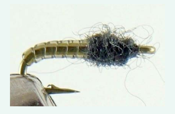
April 18 at 7:00 PM, Senior Center