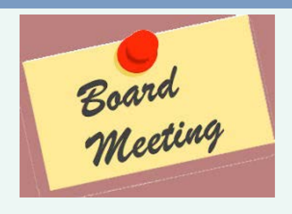
Board Meeting, April 11 at 7:00 PM, Mulligan's. Everyone is invited to