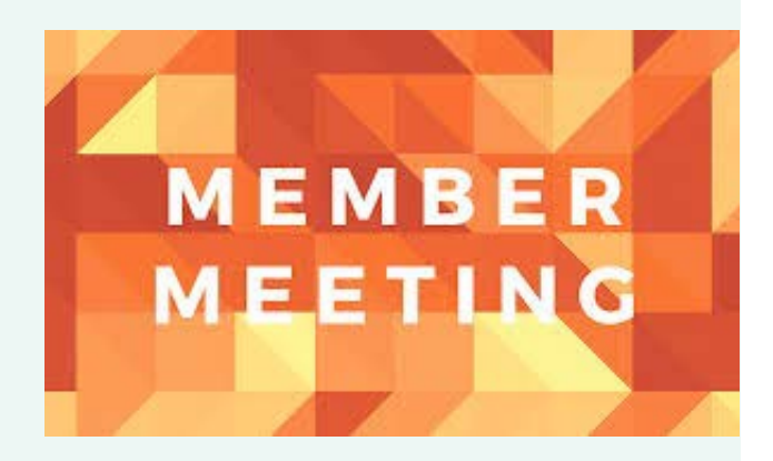
Fly Tying Expo and Dinner, February 21 at 5:30 PM, Senior Center

Board Meeting, February 7 at 7:00 PM, Mulligan's. Everyone is invited to attend