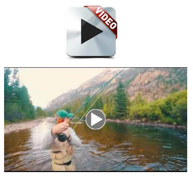
The Flypaper page 4 January, 2018

As winter continues it's fun to think about what the Poudre River was like before the ice. Remember spring....and summer? Well, let this video take you to the banks of our great resource.