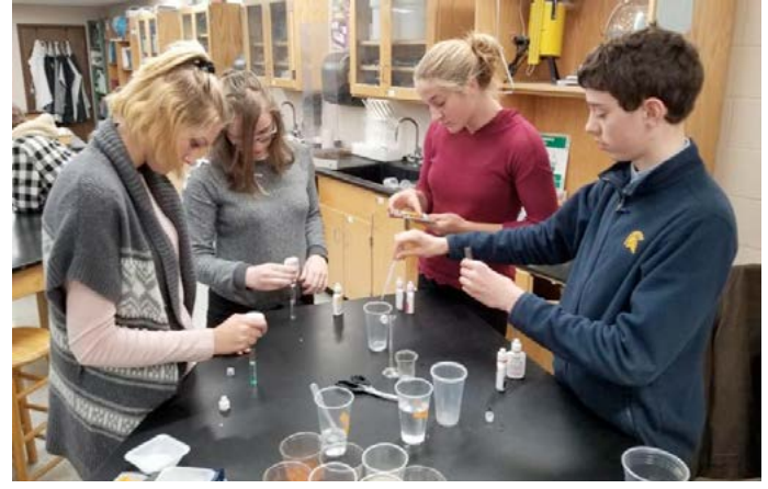
Testing water for acidity, ammonia and nitrites

Mortality of some fish is part of TIC's watersheds' reality lesson. Other key lessons, and observing the fish's behaviors, include information about watershed health. Students learn that trout and the insects they eat are early indicators about water availability and cleanliness, awakening awareness for the fish's survival and also for our human consumption. TIC helps create these awareness lessons which we hope students will remember and carry forward into their adult lives...becoming tomorrow's conservators to help ensure abundant clean, cold water and fish.