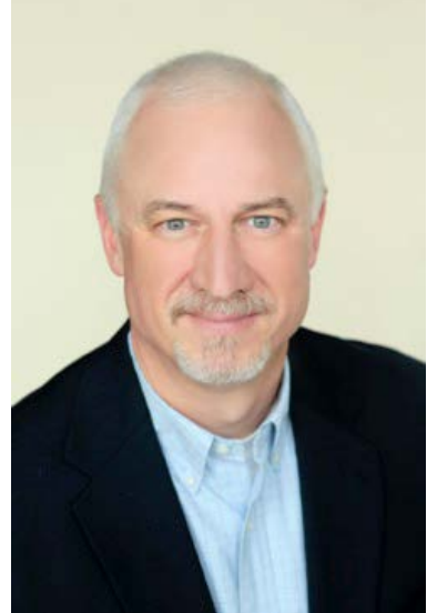
My plans for 2018 include a "bucket list" trip to Alaska with some good fishing buddies. I hope to make several floats on big water in Colorado.

2018, it's hard to believe but it's here. 2017 is in the books. The entire country is in the deep freeze and only the hardiest among us are wading the tailwaters. But as we sit by a winter fire or hover over a tying bench we dream dreams of epic hatches and rising noses. We remember the big ones and the little ones from last season. We recall road trips with friends to big water and days of solitude alone on small streams. We plan for what we hope to experience in the coming season.