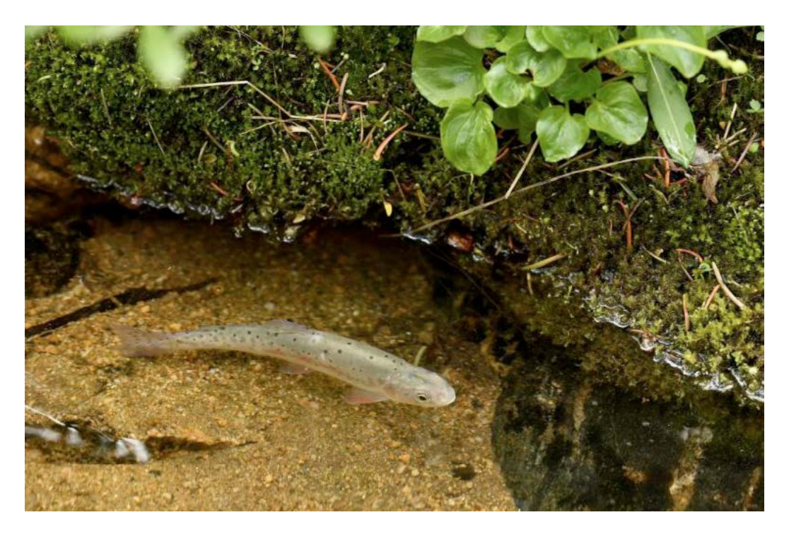
The Flypaper page 3 January, 2018

The Denver Post published last Sunday (12/31/17) a brief review of Greenbacks in Colorado and where to find them currently. Its a good story for those who have been following this saga for a while, as well as an introduction to what's known. To read it see the Denver Post article.