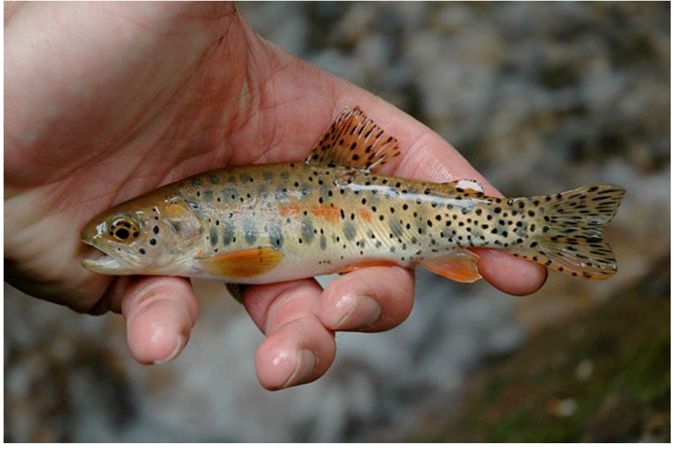
Immature Colorado Greenback Cutthroat Trout