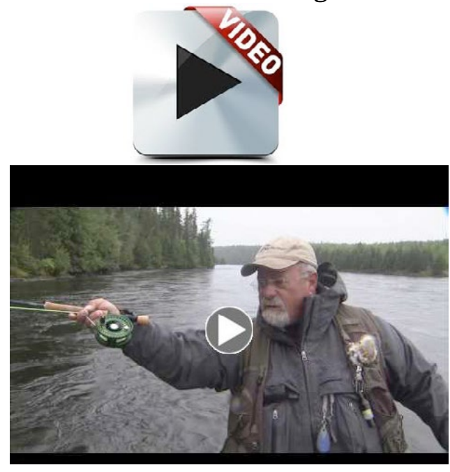
The Flypaper page 6

This month's video is from The New Fly Fisher and focuses on using streamers to catch big fish. Most of us will be using streamers in October!