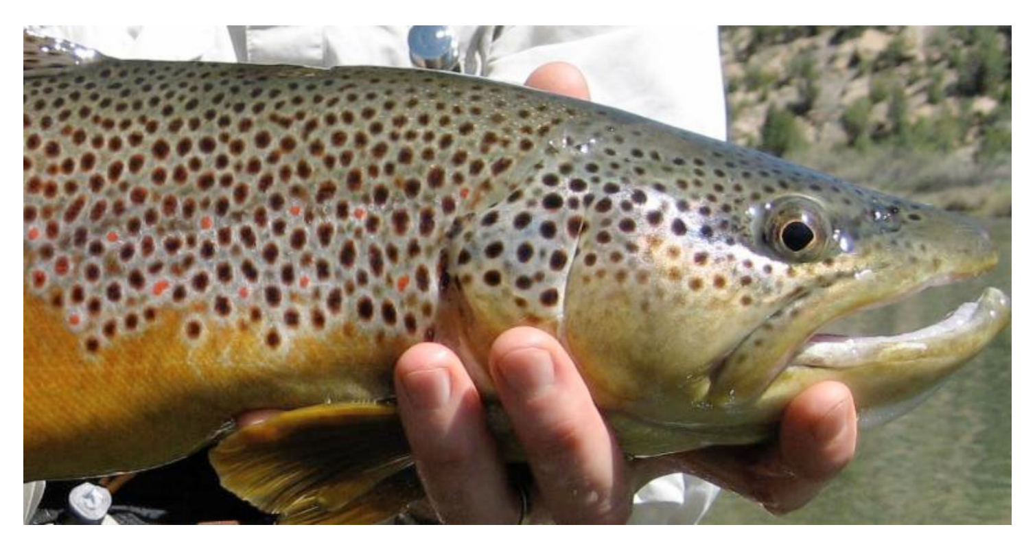
San Juan River Brown