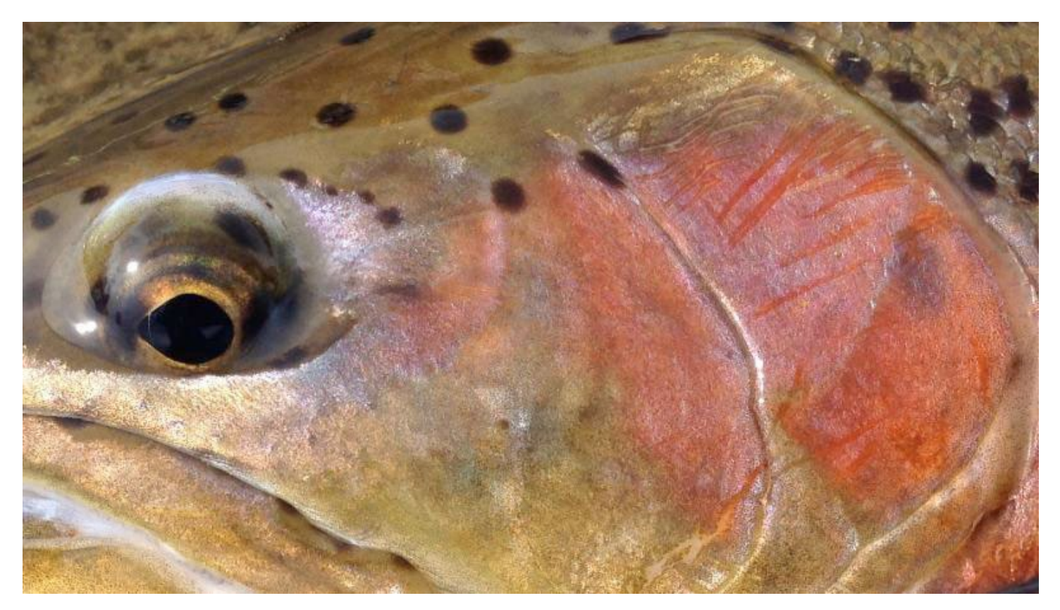
Close-up of Beautiful Rainbow