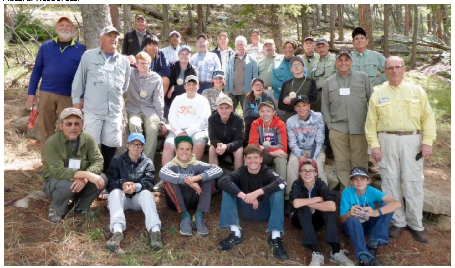
Campers and activity mentors following a day of fishing on Cub Creek in RMNP and the brief graduation ceremony

Section of Colorado Parks & Wildlife, the U.S. Natural Resources Conservation Service, CSU Warner College of Natural Resources.