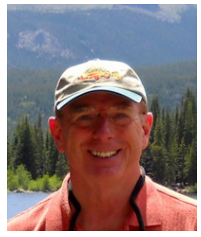
Youth Day Camp - Volunteers Sign-Up

"Thank You" to all who have responded to the previous Flypaper newsletters and emailed requests for Volunteer Mentors for this year's 7th Annual , River Conservation & Fly Fishing Youth Day Camp ...but we are still in need of more members to step forward and volunteer.