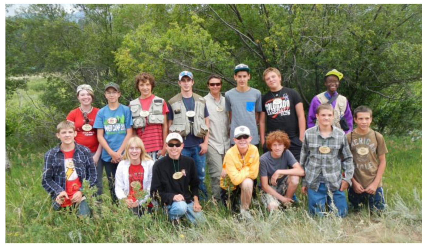
2013 RMF Youth Day Camp Participants

It's not necessary to commit to participate for the entire week; just those you can fit into your calendar and for which you have at least average skills. Instruction details are provided to volunteers for each activity, and leadership oversight is also provided at each activity.