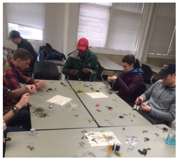
CSU 5 Rivers Fishing Club tying flies

returns to campus. The local leadership has already launched two Casting & Fly Fishing Basics classes and two Fly Tying classes. Finals are the week of May 9th and this semester ends on the 13th. Leaders are already beginning to make recruitment and programming plans for when students return next August 16th, so the new club can get off to a fast start.