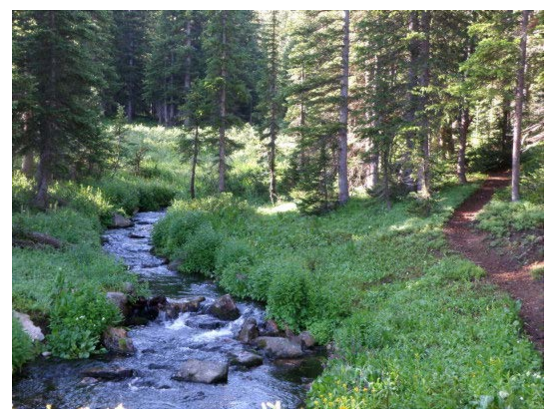
West Fork of Sheep Creek as it Flows Under Crown Point Road

Saturday, September 26 was the perfect day to be high in the alpine forests adjacent to the Comanche Wilderness Mountains. That's where a crew of 25 energized volunteers from Rocky Mountain Flycasters (RMF) and Wildlands Restoration Volunteers (WRV) tackled two reconnect projects on cutthroat trout streams. The projects had been on RMF's project list for three years. But in each prior year it was postponed by Mother Nature's supreme control of weather and her other natural powers, including ignition of the nearby High Park wildfire by lightning. On September 26, 2015 all systems and people were "GO", and the key tasks were attacked and accomplished on that one day.