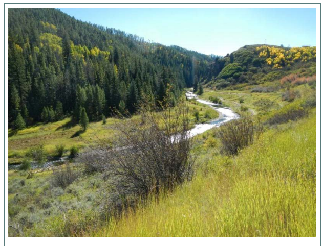
Upper & Middle Reaches Below Stagecoach Reservoir