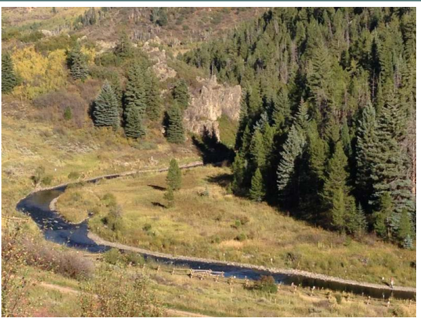
Lower Reach Below Stagecoach Reservoir