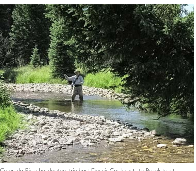
Colorado River headwaters trip host Dennis Cook casts to Brook trout in Rocky Mountain National Park

RMNP's western side Kawuneeche Valley floor boasts some of the most enjoyable brookie and cutthroat small waters fishing in the state. This upper Colorado River headwaters reach enters the dark pines forest and gently stretches along the feet of the beautiful Never Summer Range. It's easy under foot as you pass through lush meadows and follow erratic meanders dodging granite outcroppings, slowly gaining elevation as it gradually climbs toward the remains of historic silver mining Lulu City. Most anglers don't travel that far though, as they are mesmerized by the mysterious shadows, sounds and scents of the pines that envelop them. Deer, elk, an occasional pine marten or even a moose may lurk around any next turn that also holds enticing riffles