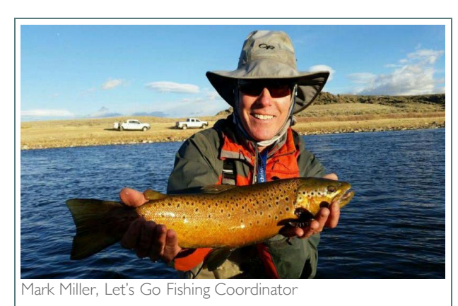
Let's Go Fishing

The headwaters of Skin Gulch are in severely burned High Park fire areas that now convey eroded soils into the Poudre River. RMF TU volunteers will be joining with volunteers from Wildlands Restoration Volunteers to accomplish hand-work planting in riparian areas and seeding/mulching native grasses along the Skin Gulch stream banks. The tentative schedule is for these activities to occur in April-May on one reach and in October-November on another reach, after heavy earth-moving equipment has completed its tasks of reshaping the Skin Gulch stream banks. To help CPRW with funding the project, RMF has applied for an Embrace-A-Stream grant from Trout Unlimited. If we receive such cash, our volunteer hours will be counted as matches for the cash grant from TU. Specific days of volunteer work will be dependent on the preceding earth-moving work, but for now, try to keep some weekends in those months open for the Skin Gulch project.