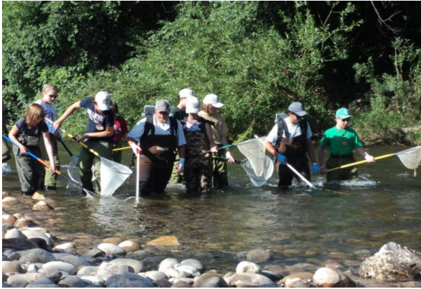
Day campers and mentors electrofishing during 2013 RMF Day Camp

To review the complete daily schedule for each of the activities you can click on this link . Please take advantage of this opportunity to influence NoCO youth about why and how fly fishing can become an enjoyable and lifelong pastime, and you'll also be helping develop the next generation's coldwater conservationists.