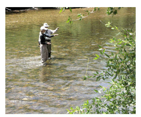
Camper Receives On-Stream Fly Fishing Instruction at 2013 Camp

RMF's Youth Day Camp will be in its 5th year this summer...assuming we get enough volunteers. Listed below is information describing the activities that require large groups of volunteers. Some members have already signed up and we are deeply appreciative, but we need more.