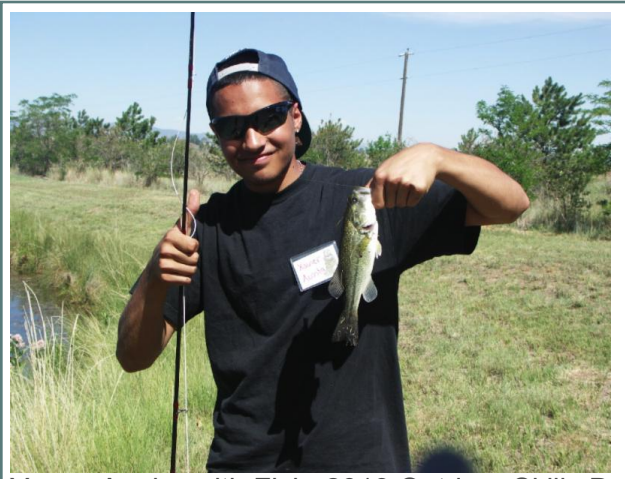
Young Angler with Fish: 2013 Outdoor Skills Day

Rocky Mountain Flycasters volunteers have operated the Fly Fishing activity and assisted youths to try their hand at casting fly rods