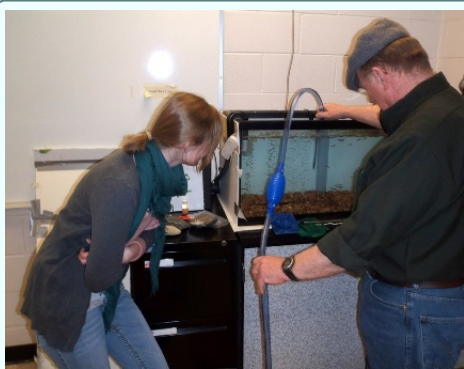
FRCC student intern observes use of a siphon vacuum to clean solid wastes from the tank

The students' time recently has been devoted to running water chemistry tests several times weekly, vacuuming out solid wastes with the siphon device, and making 5 to 10 gallon water changes using dechlorinated water that has been lowered to 52 degrees temperature with ice. Water changes help the biological filter adjust the nitrogen cycle in the tank and convert toxic ammonia and nitrites into relatively harmless compounds. Before the nitrogen cycle transition started there were about 125 fish, and during the cycle many typically will die. The FRCC tank underwent a typical experience between March 4th to 26th, during which more than sixty fish died as toxic nitrate readings increased from zero to 5 parts/million. Only two fish had died between March 15th and 27th.