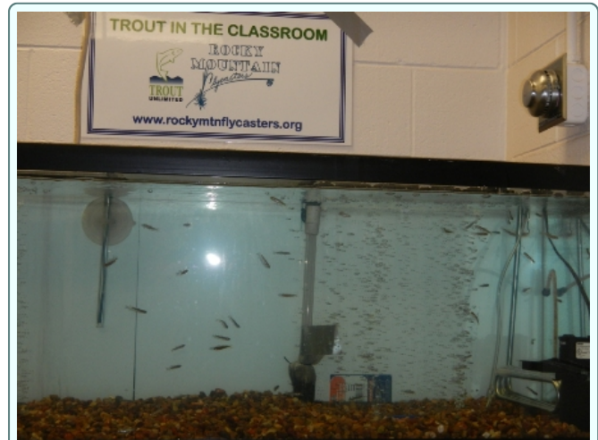
Fish are visible, and air bubbles are seen rising just right of center

After hiding under the gravel for 14-days as sac fry exhausting the content of their nutrient sac, the fish swam up to the surface on February 8th and after a couple days began feeding. They have developed the dark, vertical parr markings on their sides that are characteristic of young salmonids, and these will fade and disappear as they become sufficiently pigmented during the first year. Young fish are referred to as fry during this period, usually until about the end of one year when they will attain about three to four inches length.