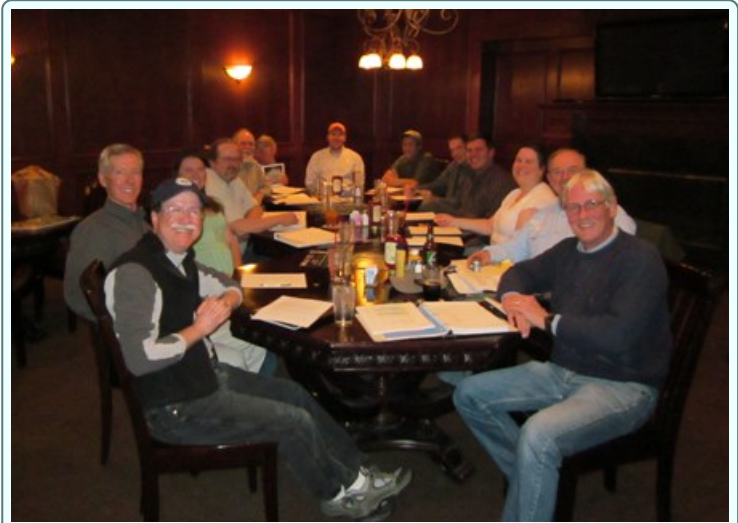
RMF Board Meeting in progress

Elections will be held at the May meeting. Nominations from the floor will be accepted with consent of the nominee.