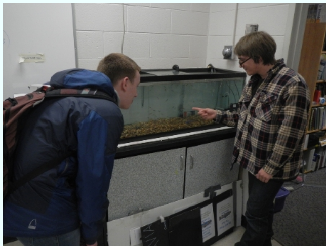
FRCC students view differing behaviors of the fish

The students' time recently has been devoted to running water chemistry tests several times weekly, vacuuming out solid wastes with the siphon device, and making 5 to 10 gallon water changes using dechlorinated water that has been lowered to 52 degrees temperature with ice. Water changes help the biological filter adjust the nitrogen cycle in the tank and convert toxic ammonia and nitrites into relatively harmless compounds. Before the nitrogen cycle transition started there were about 125 fish, and during the cycle many typically will die. The FRCC tank underwent a typical experience between March 4th to 26th, during which more than sixty fish died as toxic nitrate readings increased from zero to 5 parts/million. Only two fish had died between March 15th and 27th.