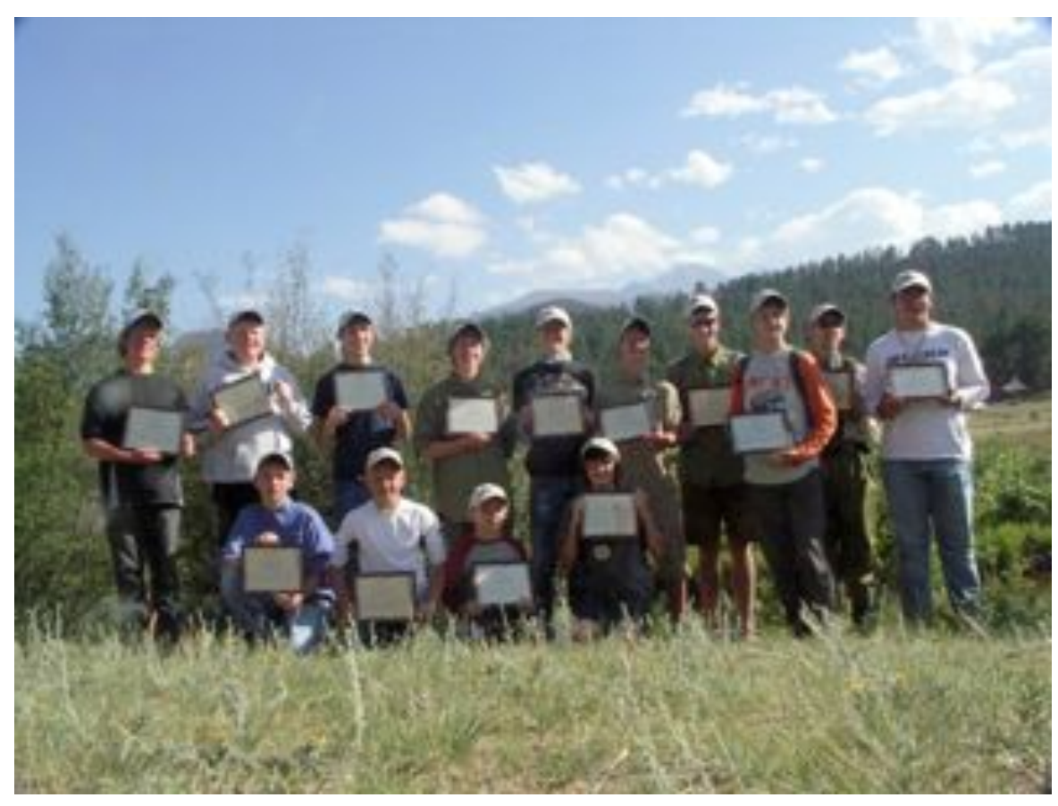
2012 Camp Attendees with Completion Certificates