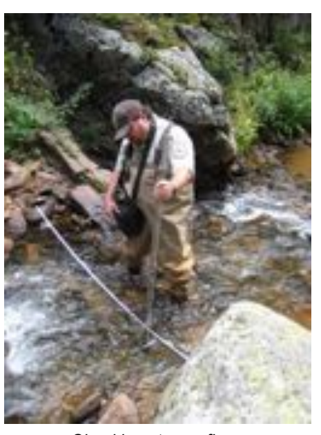
Checking stream flows

As always, the work plan schedule is subject to change, so we will stay in touch by email to confirm dates, activities and meeting places.