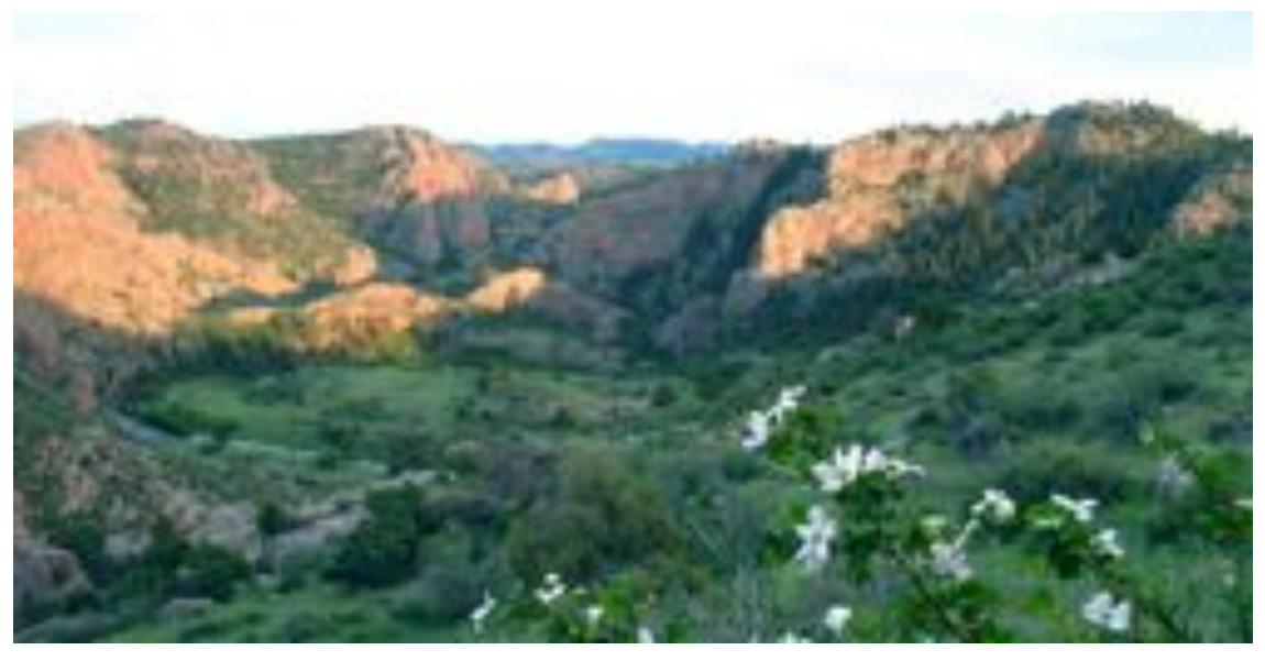
If you are not familiar with this activity; for a number of years RMF has partnered with The Nature Conservancy at

The Nature Conservancy opened their online events registration in mid April. There is one last Trail Maintenance Day listed in their newsletter for which RMF members volunteer. The date is September 16. The number of volunteers is limited to 12 per day so sign up before the slots are gone.