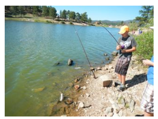
Young angler with - Fish On!

remarked during a brief conversation, "It's an opportunity to give back for those who helped get me started."