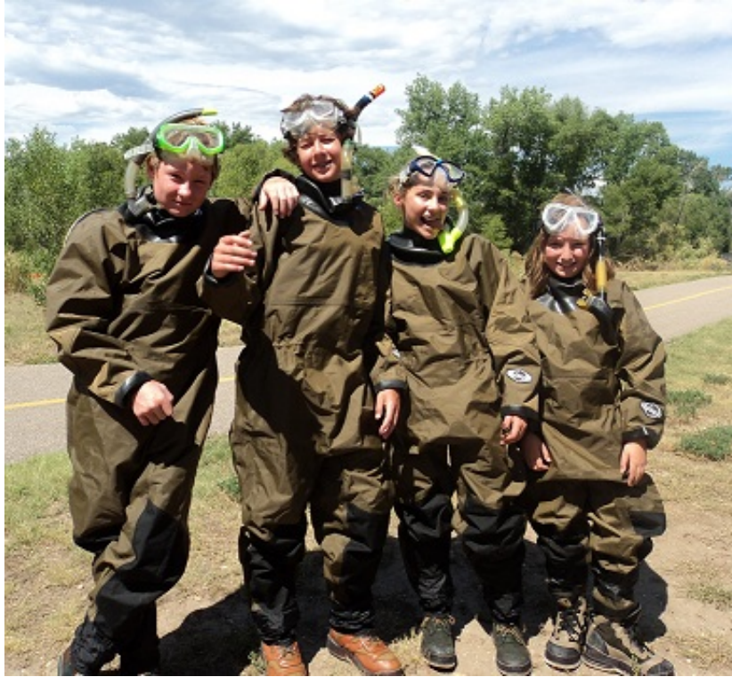
Campers snorkel to examine underwater habitat

Nine of the 15 camper openings are already filled, so if you know of an ages 14-18 boy or girl please encourage them to download the Application & Parents Information packet from the www.rockymtnflycasters.org home page. Camp runs from 8:00am to 6:00pm daily Monday through Saturday, and activities take place in Fort Collins and Loveland facilities and rivers locations.