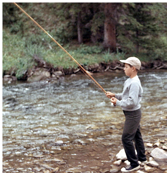
Give them a reason to go outside

Location: Swift Ponds at SE junction of I-25 and Kechter Road (LCR 36). Enter from LCR 36 about 200 yards West of LCR 5. Contact: Paul Wehr