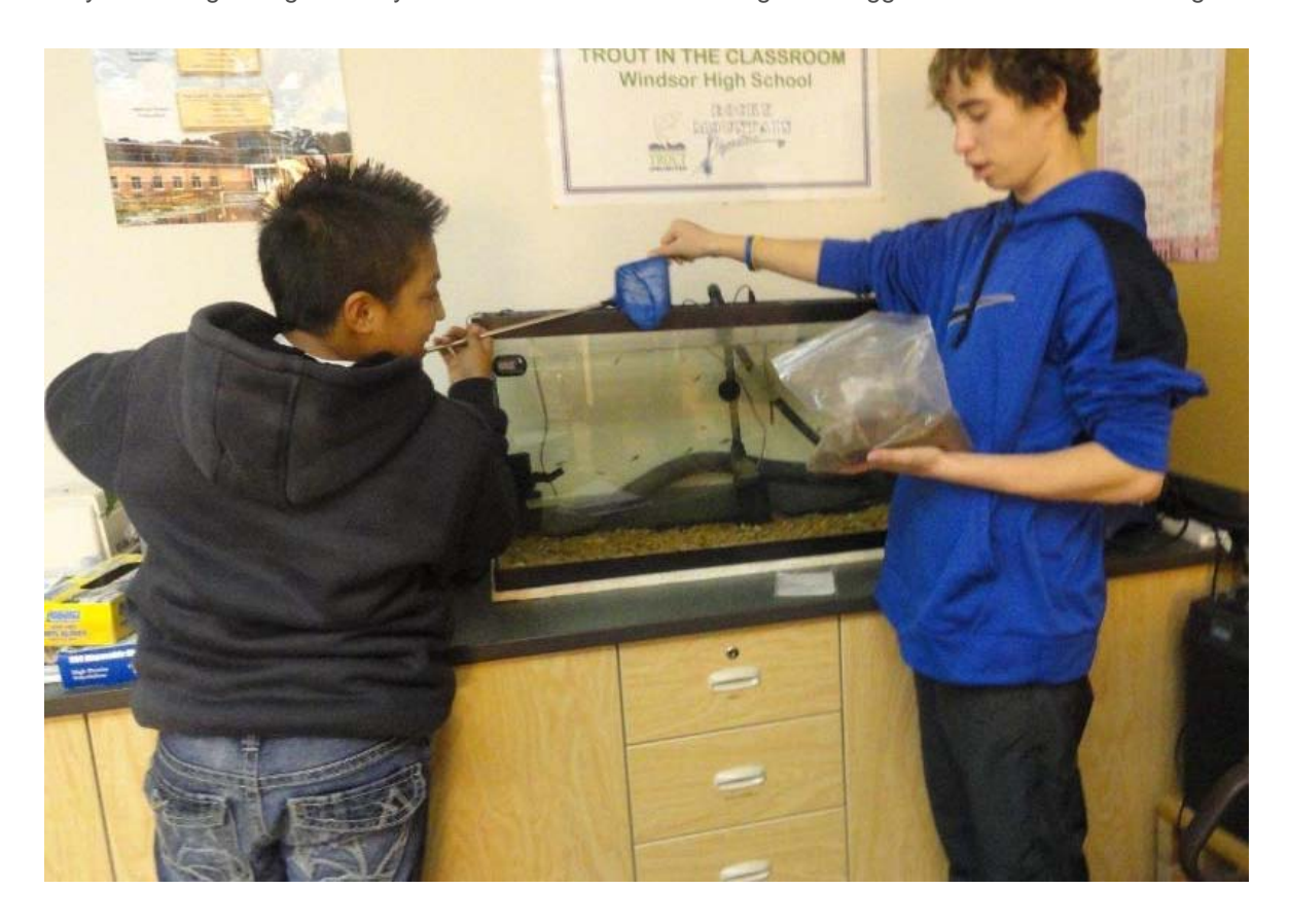
Fish are fed daily. The tank must be cleaned every-other day to remove solid wastes that cause excessive nitrogen levels that can be deadly for fish. TIC student team members maintain logs throughout the entire process.