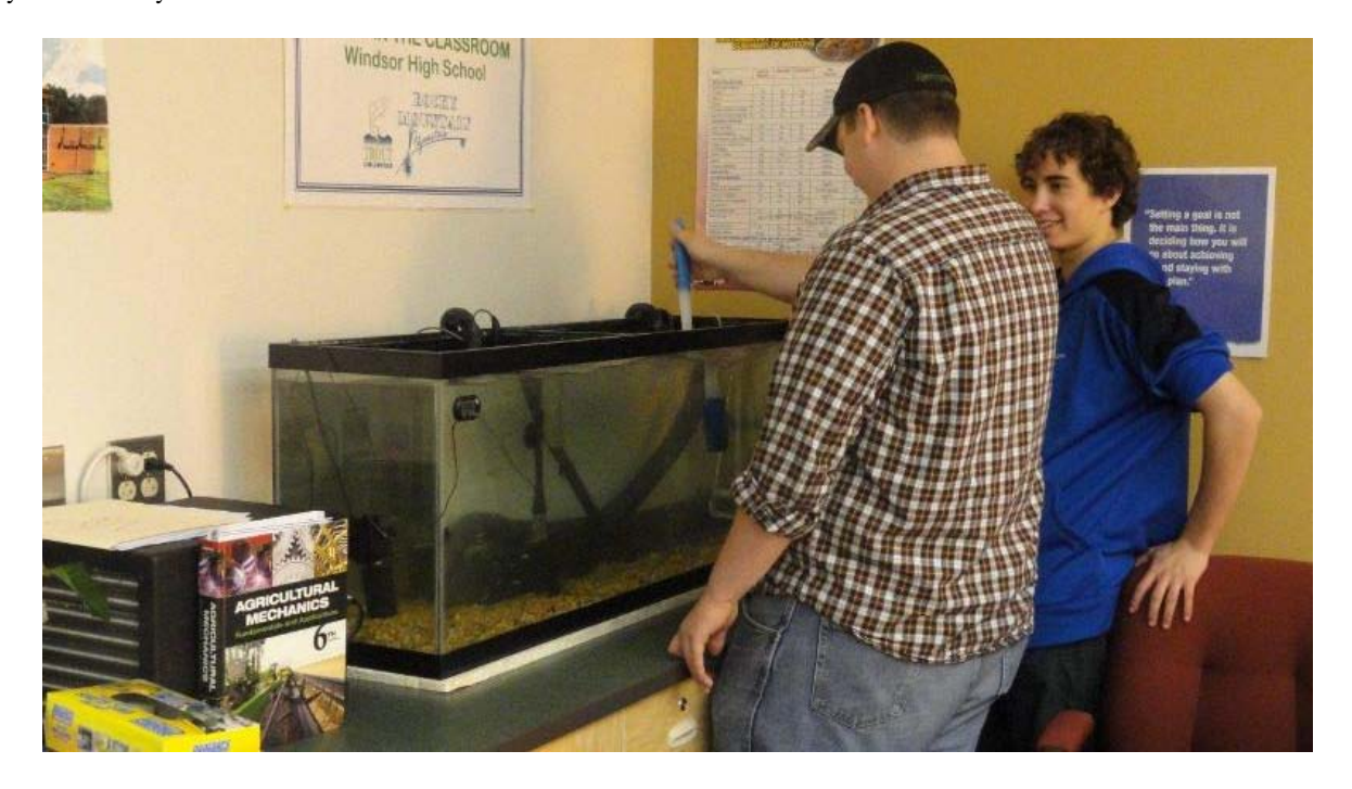
TIC Student Team members sample and check water chemistries daily to ensure required balances. Water chemistry data, fish deaths and observed fish behaviors are recorded in a detailed log. About sixty fish are growing healthily after numerous deaths during initial eggs incubation and hatching.