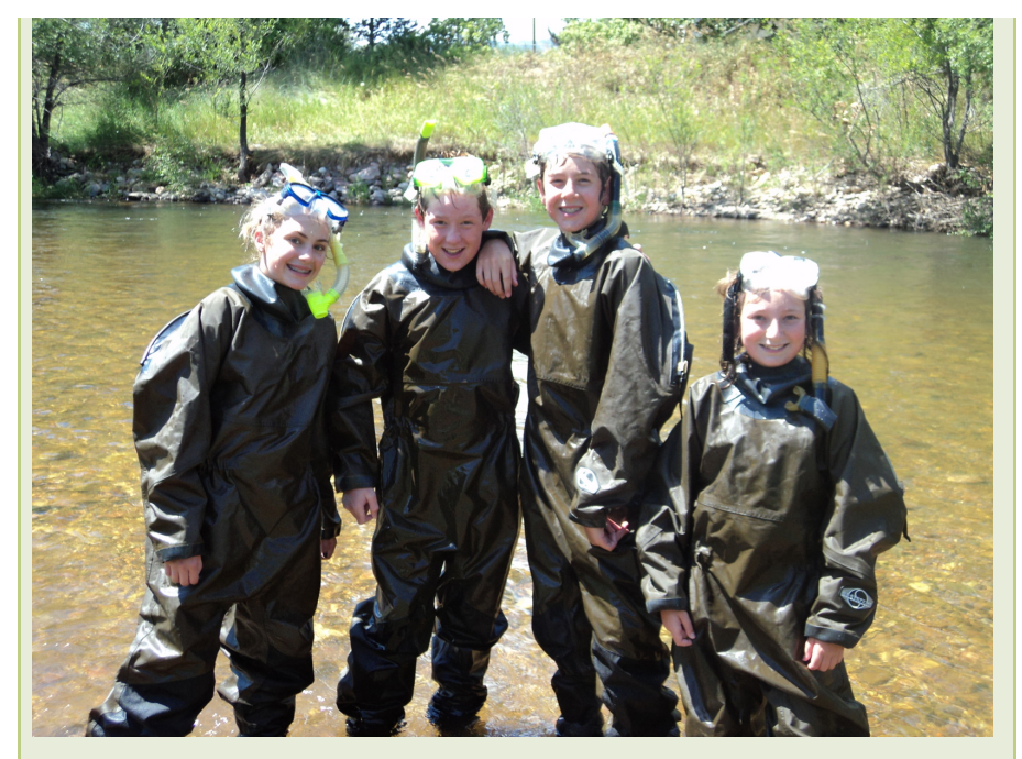
<u>Camp flyer | Camp information | Camp application</u> <u>2010 Youth Camp pictures, video, and articles</u>

Fly Tiers, we still need many flies for the kids use at camp. Please be generous.