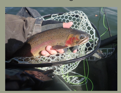
Long Draw Reservoir