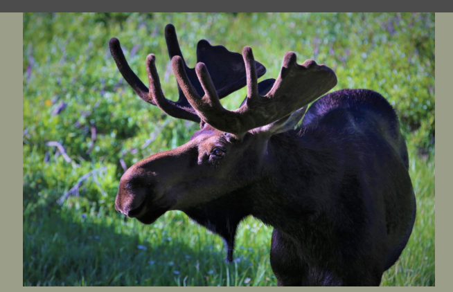
Long Draw Reservoir