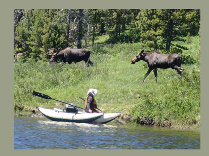
Long Draw Reservoir