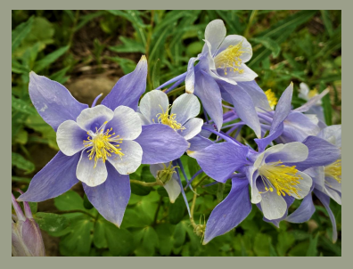
Long Draw Reservoir