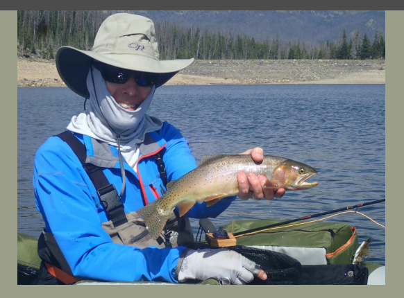
Long Draw Reservoir