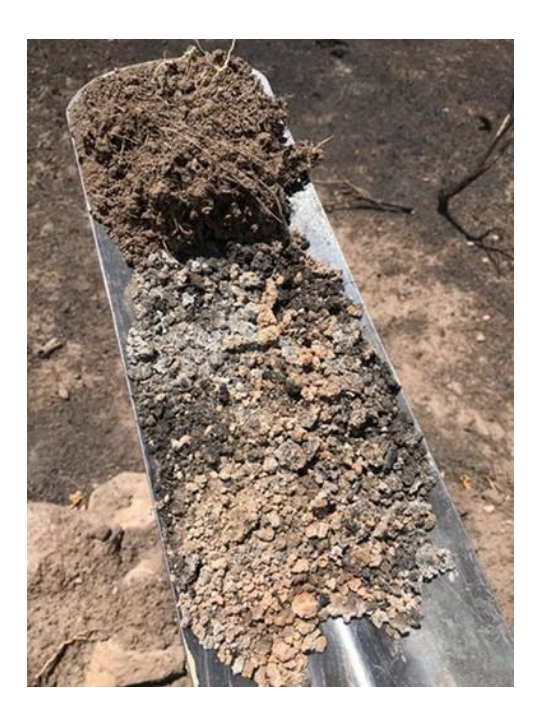
Figure 1: Comparison of low soil burn severity with roots and structure (top of shovel) vs. high soil burn severity with no soil structure or roots to help bind soil (bottom of shovel)

Areas of low and unburned SBS have minimal effects to soil properties, and therefore little to no postfire effects. Moderate SBS indicates that some soil properties have been affected and the duff and litter layer that acts as a sponge to absorb precipitation has mostly been consumed. High SBS areas have significant alterations to soil properties such as complete consumption of littler and duff, loss of root viability and changes to soil structure than often drive substantial watershed response including increased erosion and runoff following precipitation events.